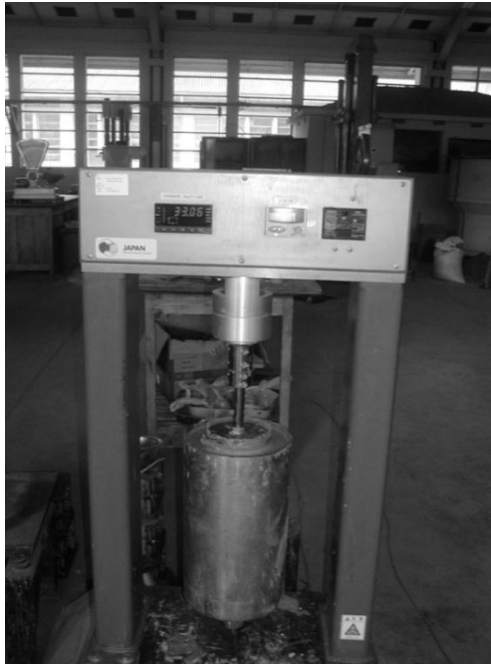
Figure 2: Rheometer