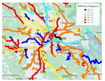
Figure 2. Efficiency Estimates of Bus Routes Figure 3. Efficiency Scores and Locations of Bus Routes