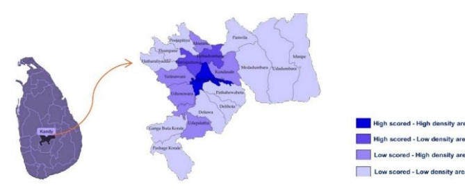
Figure 1. Areas Depending on the Service Level and Population Density.

The primary aim of this research is to evaluate the efficiency of bus routes managed by selected bus depots in the Kandy district and identify the key factors affecting their efficiency. Additionally, the study will estimate the efficiency of bus routes using a Stochastic Frontier Model (SFM) to measure the efficiency scores of different bus routes and identify the