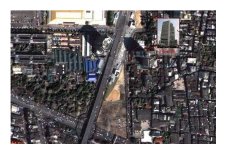
Fig. 3: Location of Klong Phai Singh To Project

Klong Phai Singh To Community (KPST) is situated on Rama IV Road in Klong Toey district. It has 380 households and all of them are low-income occupants. From the beginning, it was a tanning factory, but after it was abandoned, immigrants had moved to the site and build their own houses, which had turned to slums in the 1980's. In 1981, Bangkok Metropolitan Administration (BMA) had planned for Ratchadapisek Road that will cut through this area. Then, CPB decided to develop the slum in this area by using Land Sharing Development as a tool, which CPB can use other lands after land sharing development for commercial purpose.