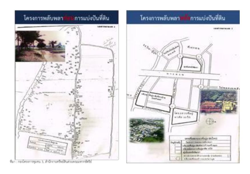
Fig. 8: Plubpla Before & After Land Sharing

Like Klong Phai Singh To, Plubpla project was starting from the trail breaking in 1988, which is called "Ram Intra Road". It is situated in Wangthonglang District in the outer zone of Bangkok. Total area of Plubpla is 300 rai and has 260 households, contains both side of Ram Intra Road. CPB had moved slums, which spread all over the area, into the area near Plubpla canal. So, this community has divided into 2 communities, called Moo Ban Plubpla Community (30 rai) and Klong Plubpla Community (46 rai). With this Land Sharing Development, CPB has gained lands for commercial development and has lands for low-income community that serves workplaces around the area. (Champathong, P. 2014.)