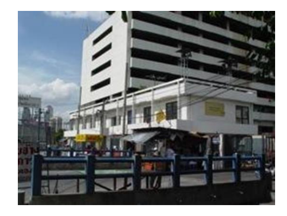
Fig. 7: Klong Phai Singh To Building

Finally, the advantages of Klong Phai Singh To Project are 1) Occupants still live nearby their old houses. 2) The building can contain occupants more than they had estimated. 3) Physical