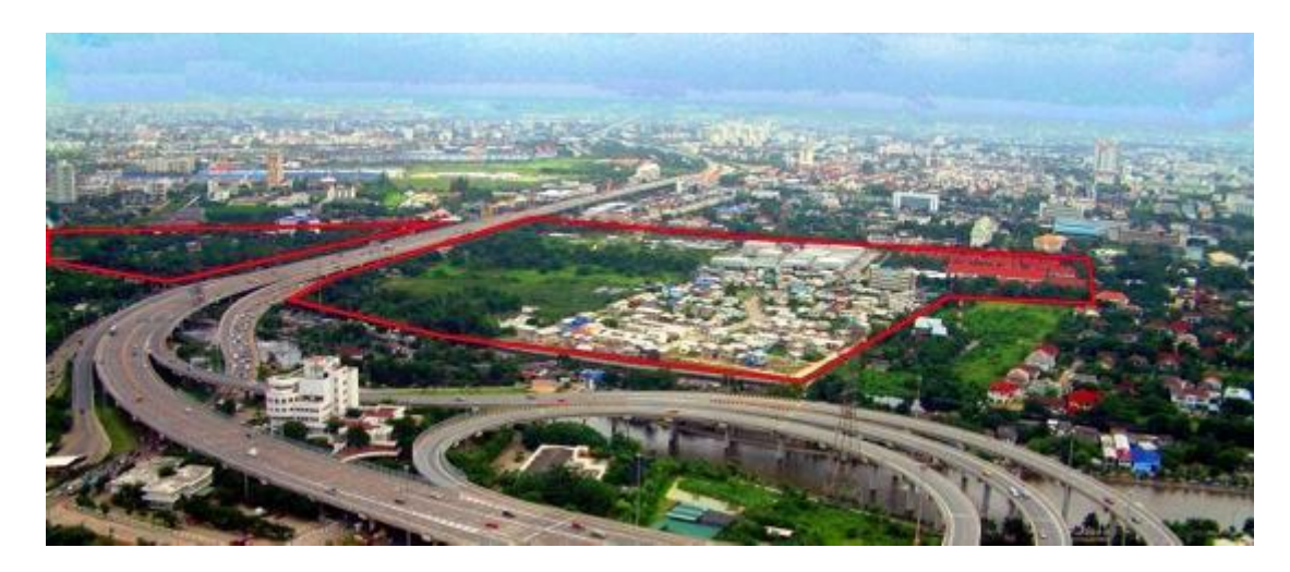
Fig. 9: A Bird's Eye View of Plubpla

and built the houses. Another part, which is Klong Plubpla Community 30 rai, saw the development and interested to upgrade their community. (Chaidetsuriya, S. 2014.) This is the case that shows the will of occupants, who wished to develop their community and participated with the landowner to find a way on development.