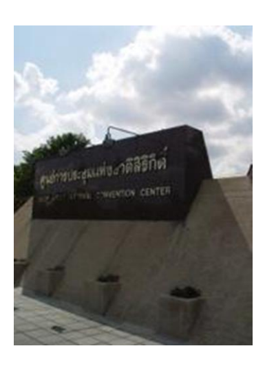
Fig. 5: Queen Sirikit National Convention Center

However, moving slum people into high-rise building on the same location has some benefits to those occupants and surroundings' socio-economic (Rojnakarin, J. 2003.) because they don't have to move to another place and find new jobs. 65% of occupants have been working on the same job since they were living in slums (Rojnakarin, J. 2003.) such as street-side restaurants, workers, drivers, and etc. Meanwhile, the building itself also has an impact because it was a new high-rise building at that time, which was very modern and full of facilities. It had raised the look of surroundings to be more modernized.