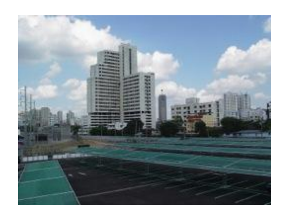
Fig. 6: A View of Klong Phai Singh To