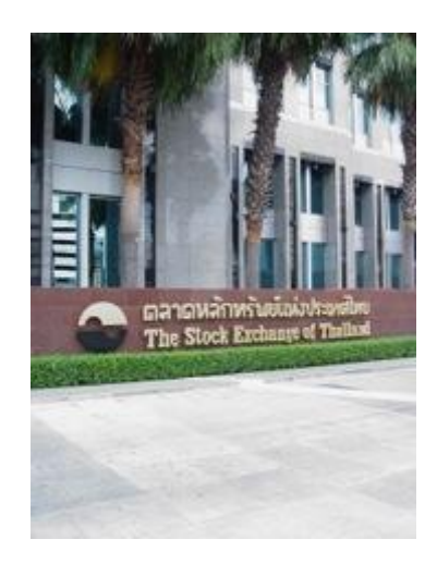
Fig. 4: Stock Exchange

their junks outside the window from on higher floor. So, their junks had flown through some roofs of houses nearby. (Champathong, P. 2014.)