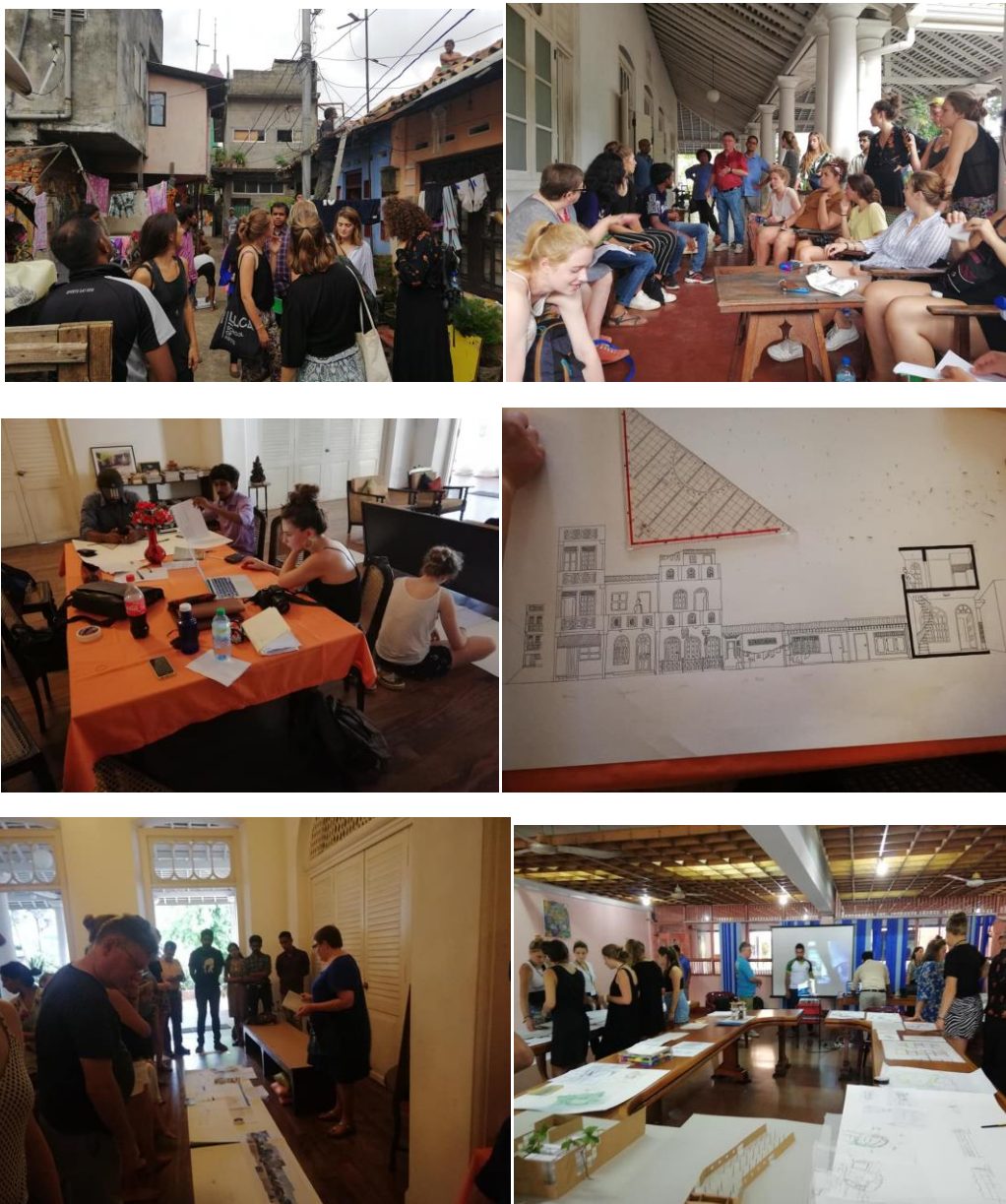
Fig. 3: Reconnaissance survey and documentation through 1:50 scale section Author: Dhanesh Chathuranga