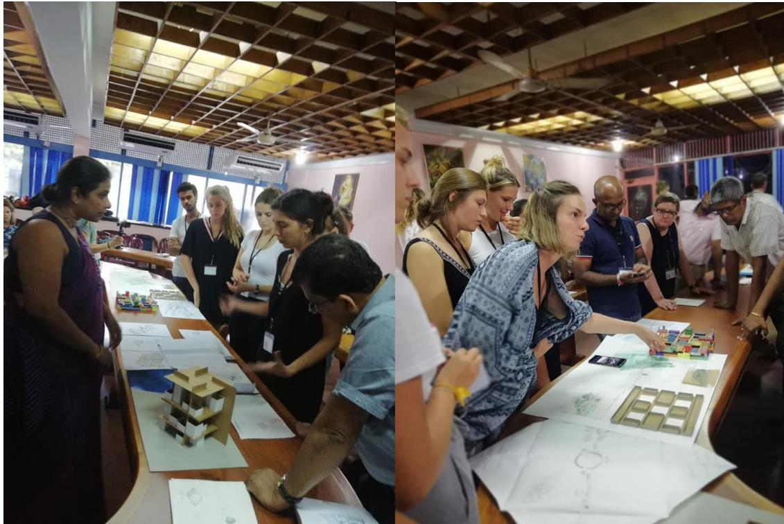
Fig. 4: Detailed studies extrapolating current towards future 'urban living' conditions Author: Dhanesh Chathuranga