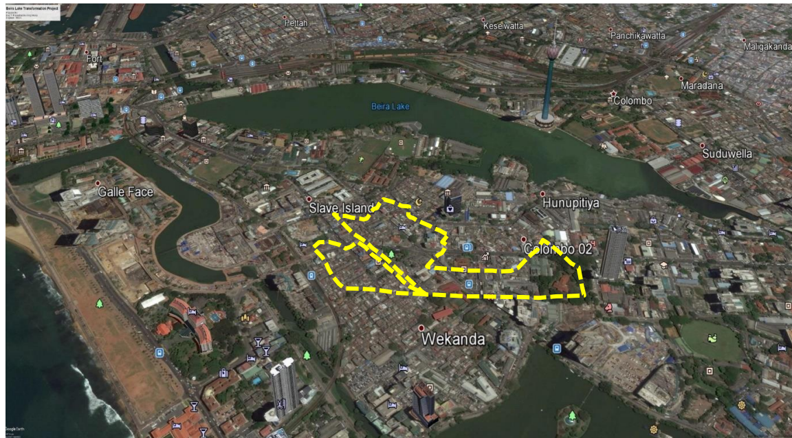
Fig. 1: Vauxhall Street Redevelopment