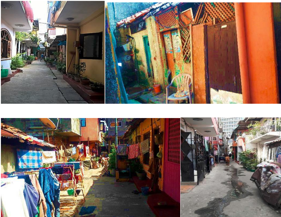
Fig.2: Vauxhall Street Housing Area – 16 Clusters