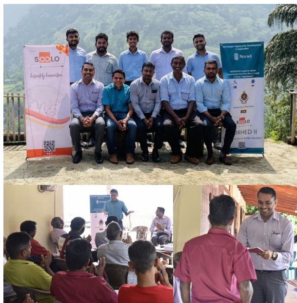
Figure 1: Workshop held for smallholder farmers in Kolonna area.

In comparison to its competitors, Sri Lanka's tea estate land productivity is relatively low. The yield per hectare (YPH) in Sri Lanka is 1,532.8 kgs, while in Kenya, it is 21,77.2 kgs, and in India, it is 2,143.3 kgs. Possible causes for the low YPH include slow replanting rates, ageing plant stock, soil fertility degradation, lack of attention to proper agricultural practices, and other supply chain vulnerabilities. Currently, the Center for Supply Chain, Operations and Logistics Optimization (SCOLO) and the Department of Transport Management & Logistics Engineering (TMLE) of the University of Moratuwa is involved in a project to enhance lean practices of the tea smallholders' supply chain through digitalization with the assistance of NORHED II grant (Grant ID-68085) in collaboration with the University of Stavanger, Norway. This project plans to employ "risk-based thinking" along with ISO standards (ISO 9001:2015 and 14001:2015) to minimize the waste in tea in the supply chain [3]. The primary objective of this project is to empower farming communities while adding value to Sri Lanka's tea supply chain.